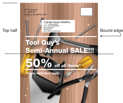
Catalog addressed on back cover. “Top” is the upper edge when the spine is on the right.

You can place the delivery address on the front or the back of the mailpiece, but it must be on the same side as the postage. The address may be parallel or perpendicular to the top edge, but not upside-down as read in relation to the top edge. A perpendicular address can face to the left or the right.